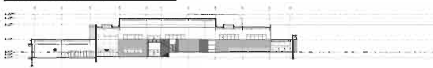
FIELD HOUSE COMMONS SECTION - LOOKING SOUTH