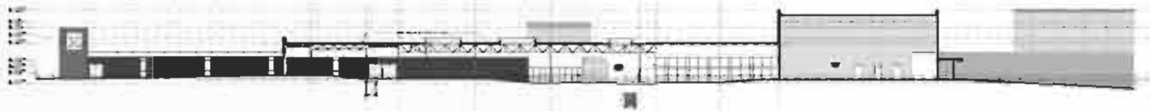
STUDENT COMMONS SECTION - LOOKING EAST