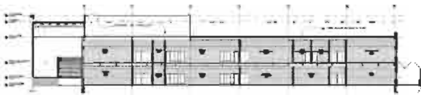
ADDITION SECTION - LOOKING EAST