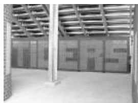
Tiger Wall - Valley Stadium